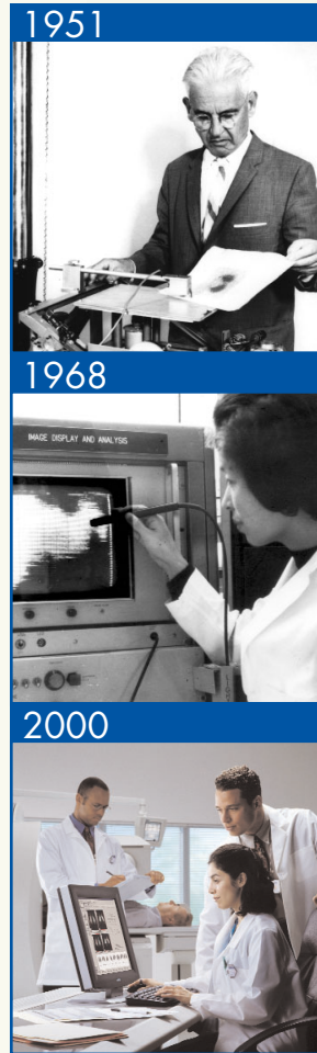
Top: The first scanner was introduced by Benedict Cassen in 1951. Middle: The Image Display and Analysis minicomputer system in 1968. Bottom: Nuclear Medicine team evaluates patient scan.

tools are developed, PET and PET/CT scanning will prove to be an invaluable tool in the diagnosis and treatment of some of the most critical diseases challenging modern medicine.