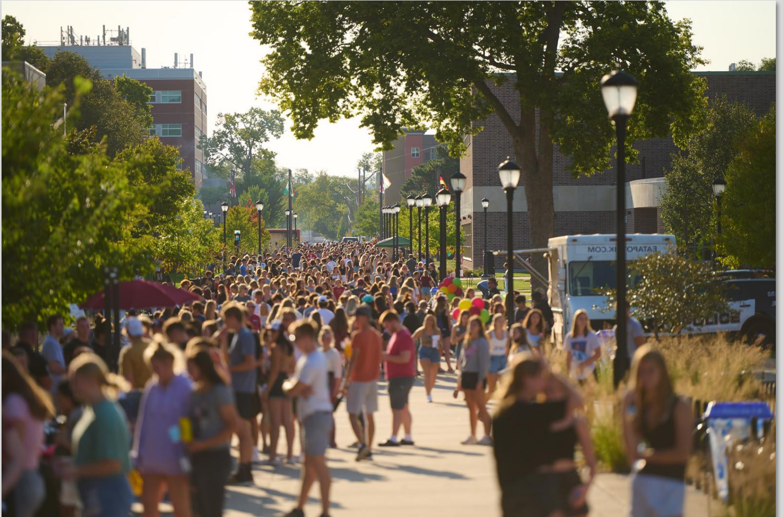
Students walk Badger Street Mall with energy and excitement to celebrate the first annual Eagle Fest, September 10, 2021