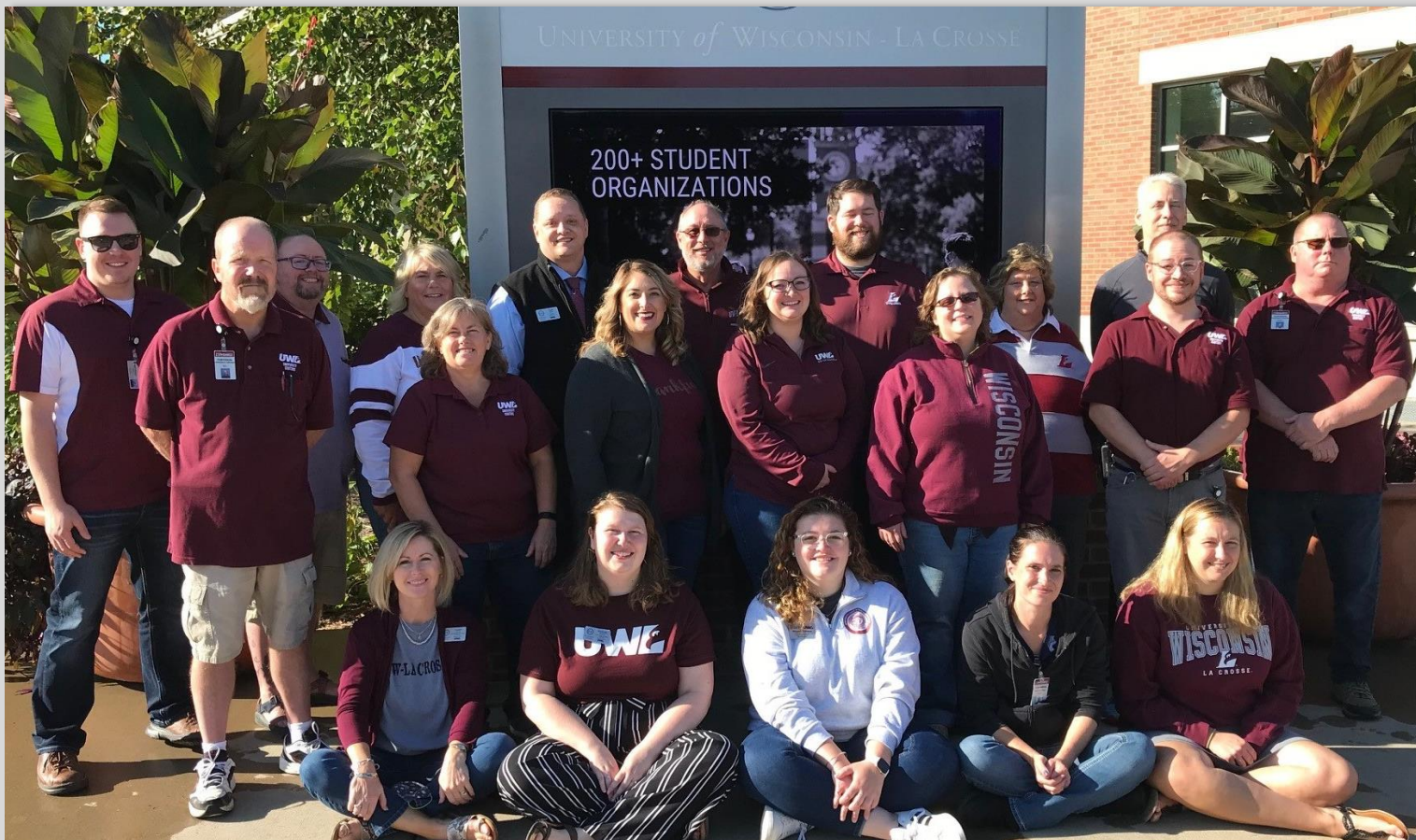
University Centers Staff ready for the fall semester - September 2021