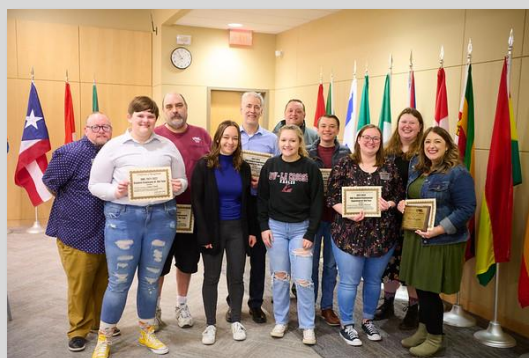
Student Employee of the Year and Student Employee Supervisor of the Year Award recipients and nominees (above).