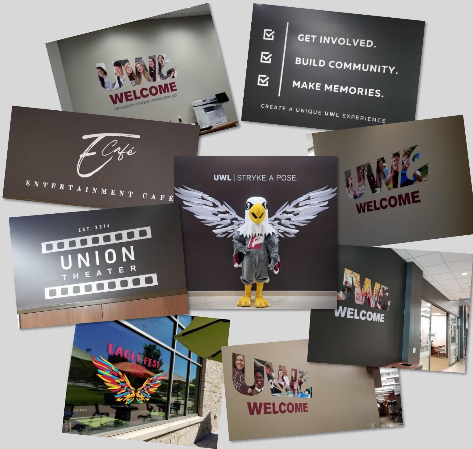
University Centers staff is overjoyed to see the above new vinyl wall art installed throughout the Student Union in June 2022! The art is featured in the following locations: Clockwise from top left: University Centers/Dining Services Administrative Office, The COVE, southwest entry, north entry, east entry, Eagle Fest 2022 wings facing the Union patio/lawn, Union Theater, Entertainment Café, and the Stryke A Pose-Wing Wall outside the Union Theater.