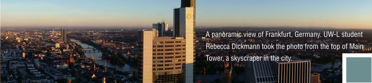
A panoramic view of Frankfurt, Germany. UW-L student Rebecca Dickmann took the photo from the top of Main Tower, a skyscraper in the city.