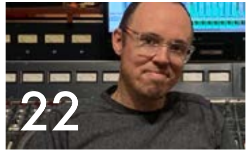
Live from New York