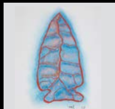
Untitled (Arrow Head), 1987, pastel on paper, 14 x 10 3/4"