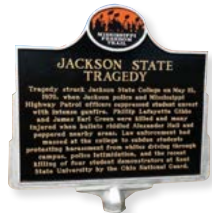
Students also headed to Jackson State University in Mississippi where in 1970 two African American students were shot by state and local police.

has plans for a northern Civil Rights and Underground Railroad course and trip.