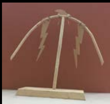
Bird Form, Petroglyph Series, 1995, wood, leather, 21 x 20 1/2 x 5 1/8"