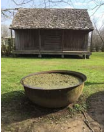
The January pilgrimage included a stop at Whitney Plantation in Louisiana. It's one of the first U.S. plantation museums that tells the story of plantations and slavery from the perspective of those enslaved there.

T he trip took them to Atlanta, Birmingham, Tuscaloosa, Montgomery, Selma, Gulfport, New Orleans, Jackson, Little Rock and Memphis. They visited these sites and more where major events happened during the civil rights movement in the '60s — decades before the students in the group were even born.