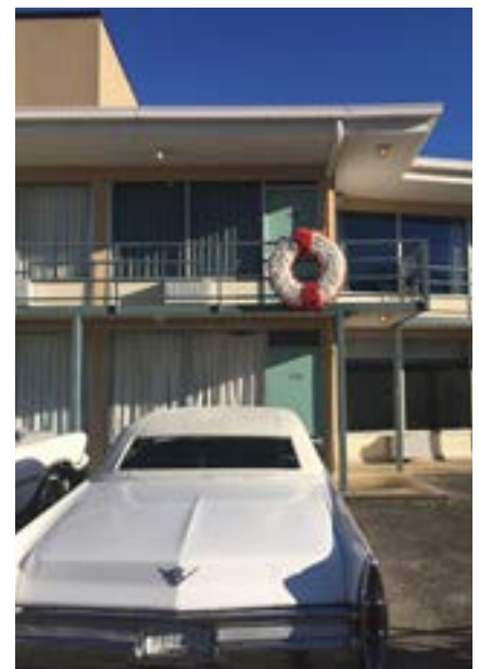
The stop in Memphis included the balcony where Martin Luther King, Jr., was assassinated.

“Students come back from the trip transformed and with a greater appreciation of the many well-known and lesser-known women and men who challenged white supremacy and racism during this critical moment in our nation’s history,” Breaux says. Many of the activists in the movement were the same age of current students when they risked their lives protesting for rights.