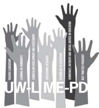
A leader in Educational Transformation

For more information please visit: www.uwlax.edu/mepd/lc/locations.html