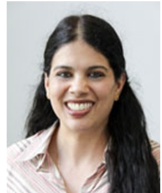
Gita Pai History Department

All levels of Metalsmithing/Art 220, 221, 222, 320, 321, 421, 413, 425 3D Foundations/Art 166 Art Appreciation/Art 102