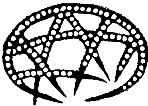
Pentagram Press Minneapolis 1987

When the new Murphy Library was completed and opened in 1969, it provided for a Special Collections Department on the second floor. This facility was to provide special handling and security for several categories of library materials and for the already existing Area Research Center collection that had been moved from the old Florence Wing Library. It is typical of such facilities that they will reflect, to some extent, the interests and eccentricities of their curators. With the strong support of the library administration and several faculty members, this new department set about to collect regional writing and the representative presses, especially where the resulting collections would be both unique and strong.