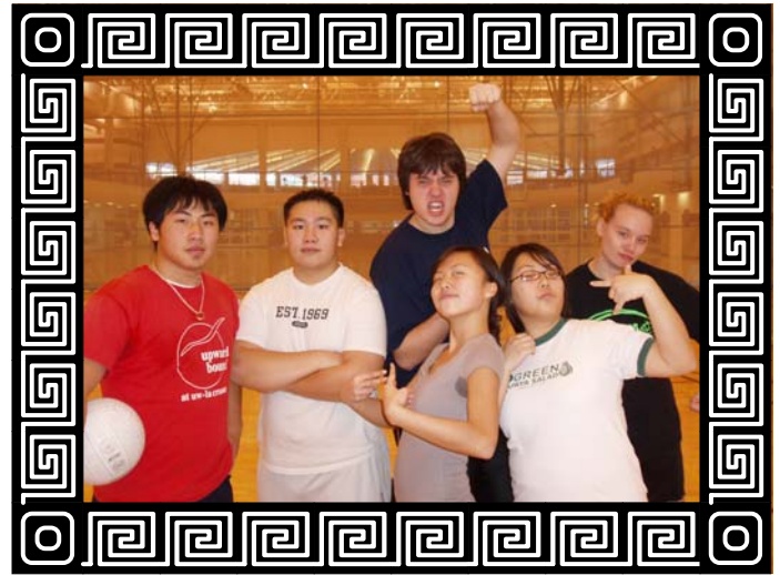
Photos from UB's 2nd Annual Winter Volleyball Tournament '08 @ UWL's Recreational Eagle Center. More than 40 current students and alumni participated. What a blast!