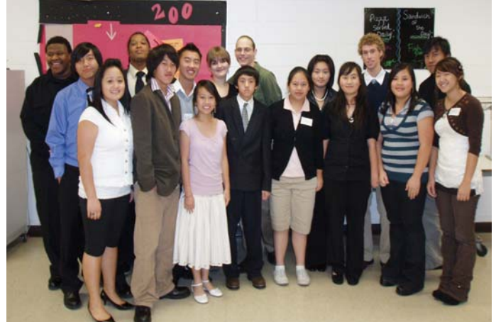
Photos from UB's 25th Annual Career Day at Central High School. Students & parents discussed career development with more than 20 community professionals, before heading to dinner at China Buffet.