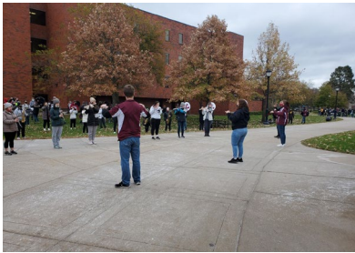
Members of the Screaming Eagles Marching Band perform outside Campus Child Center