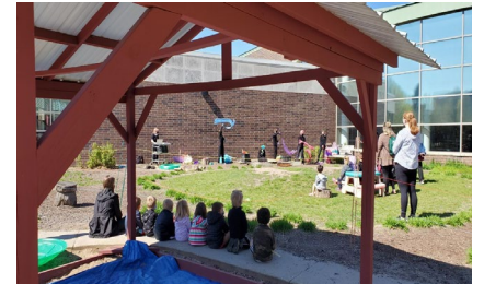
Children from Campus Child Center watch a performance of “Squiggles” on the playground

We look forward to returning to a higher level of university collaboration when it is safe for us to do so.