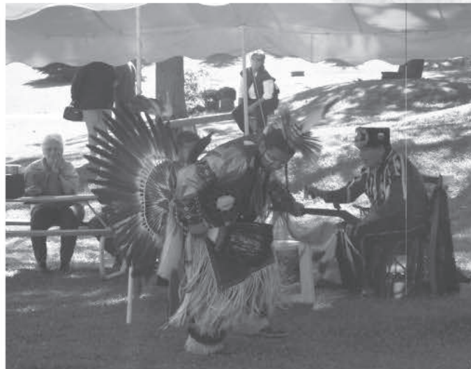
The Wisconsin Dells Singers provided traditional dancing and drumming during Archaeology Day at Silver Mound.

A number of tireless volunteers were on-hand to help out with the crowd at the campgrounds. A special thanks to those who took the time to join MVAC staff in making the day run smoothly.