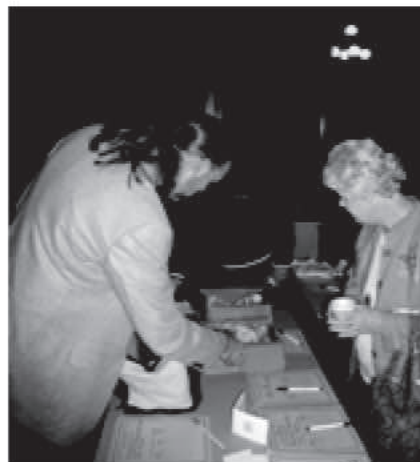
Thanks to all our donors!

The generosity of many individuals and local businesses helped make MVAC's first silent auction a success. Held in conjunction with our Annual Reception in November, the auction raised over $950 in support of MVAC.