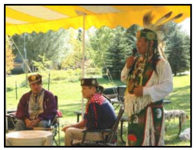
The Wisconsin Dells Singers provided Traditional entertainment.