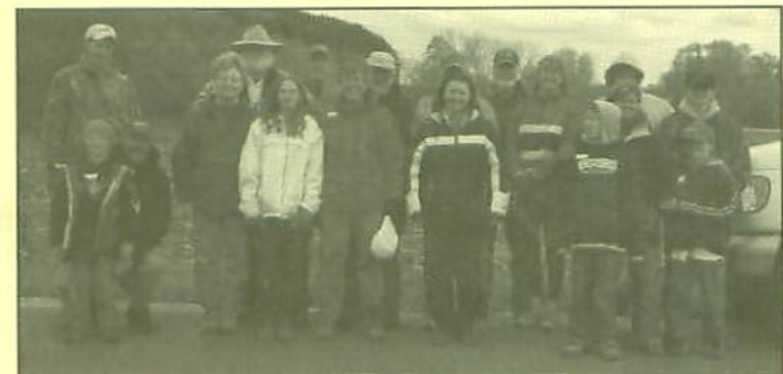
Public field survey volunteers on Saturday, April 30.

several known sites were revisited. Each day ended back in the lab, where most of the recovered artifacts were washed in preparation for cataloguing and curation. Thanks to all the volunteers who joined this year's survey.