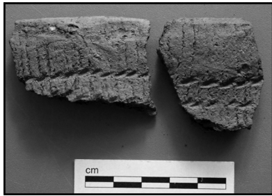
Top: Marion Thick ceramics recovered from Unit 32S-50W. Bottom: Cord-impressed over cord-marked ceramics from Unit 32S-52W.