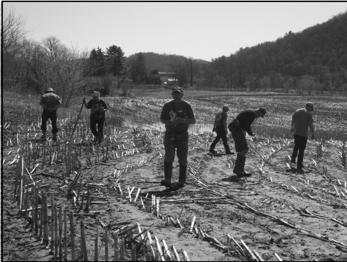
Public field survey in the Coon Valley area.