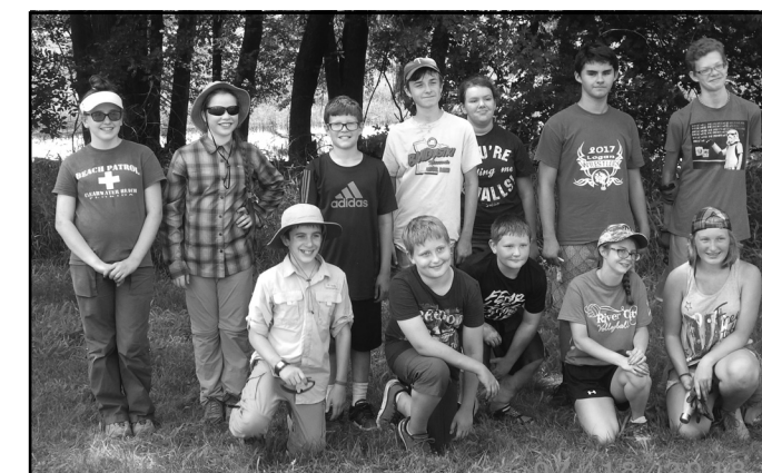
Participants in the 2018 Middle School Field School.