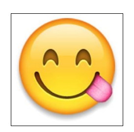
Retrieved from: http://allrecipes.com/ recipe/9471/peanut-butter-cup-cookies/