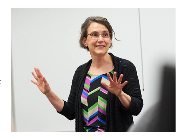
To read more about the Eagle Teaching Excellence Award, please visit: http:// news.uwlax.edu/top-teachers/

"You don't have problems; you have opportunities." - my dad