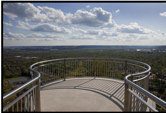
View from Grandad