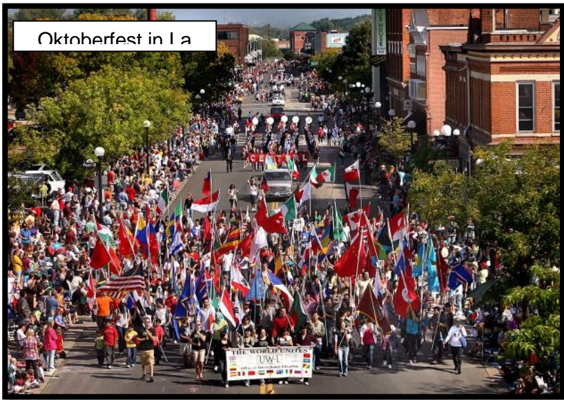
Oktoberfest in La