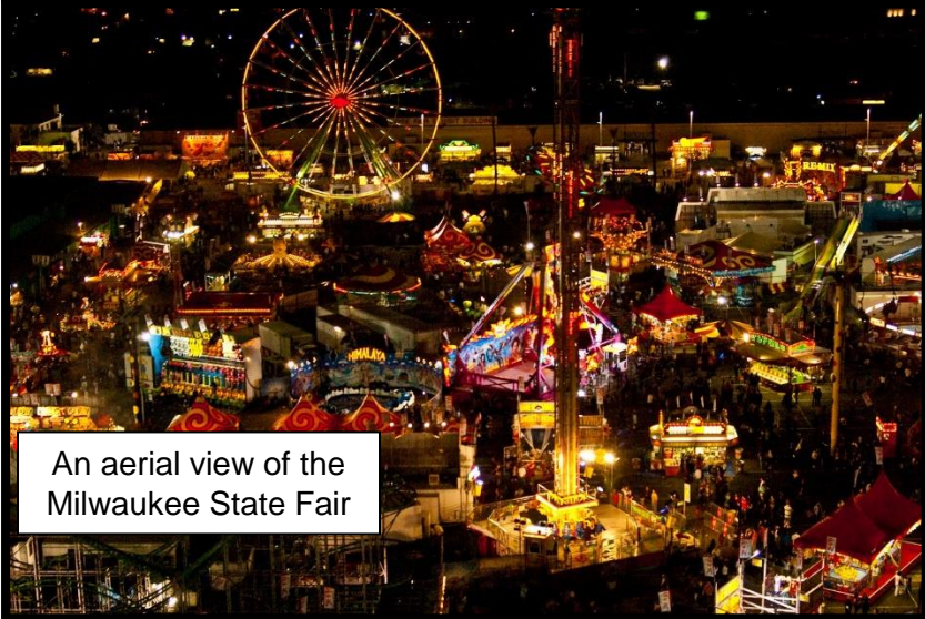
An aerial view of the Milwaukee State Fair