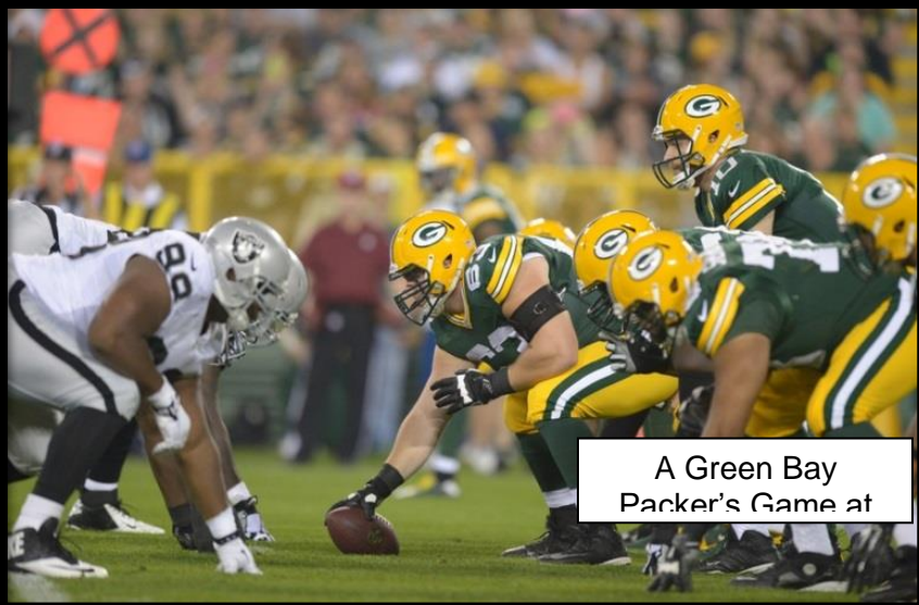
A Green Bay Packer's Game at