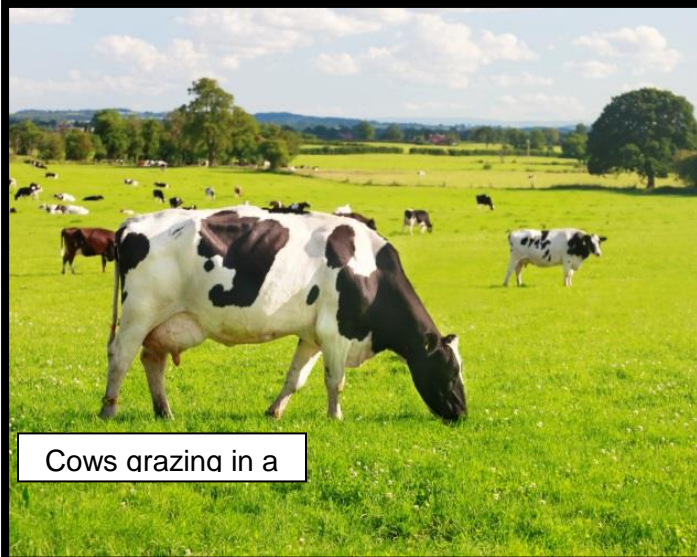
Cows grazing in a