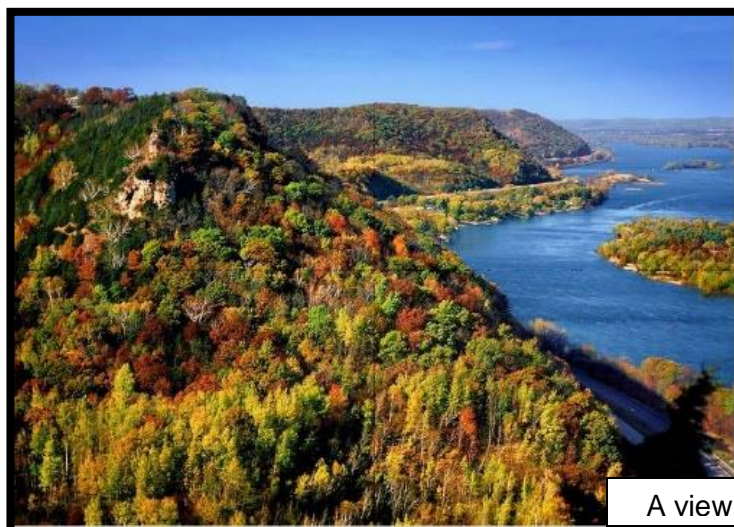
A view from the