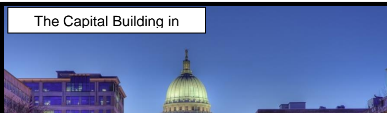
The Capital Building in