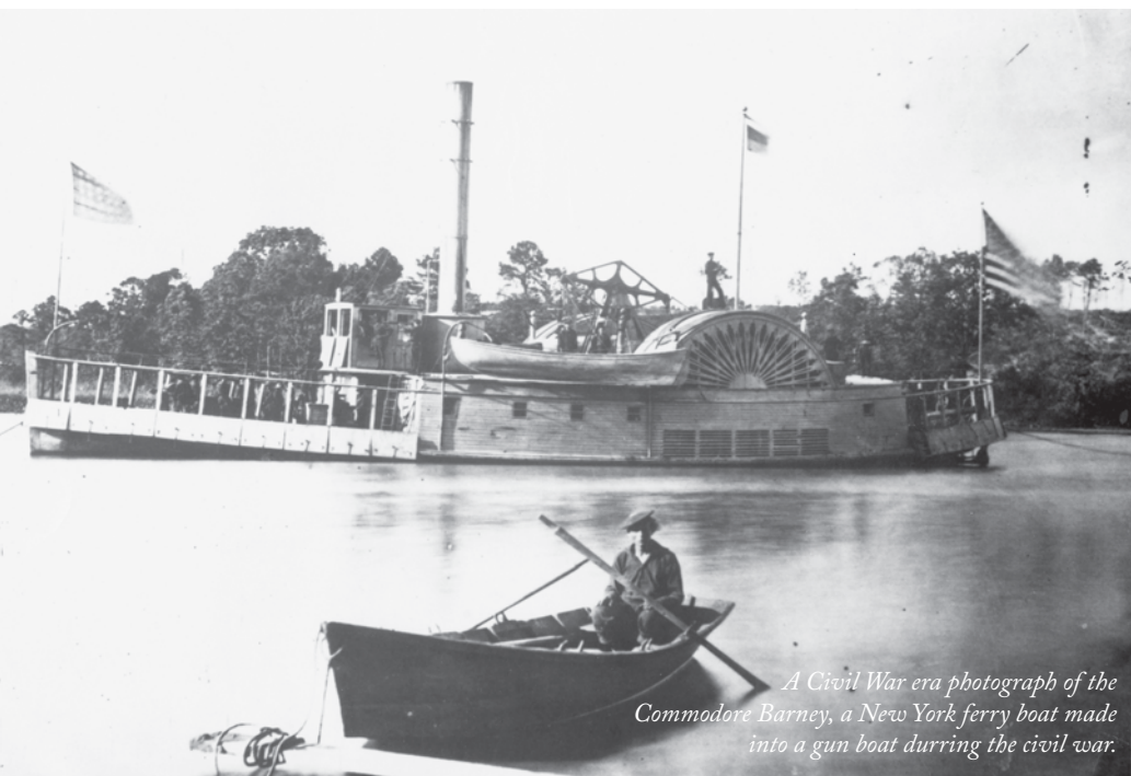
A Civil War era photograph of the Commodore Barney, a New York ferry boat made into a gun boat during the civil war.