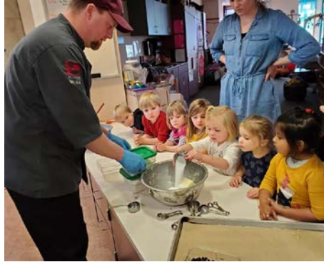
Chartwells staff join children for "Books with Cooks".