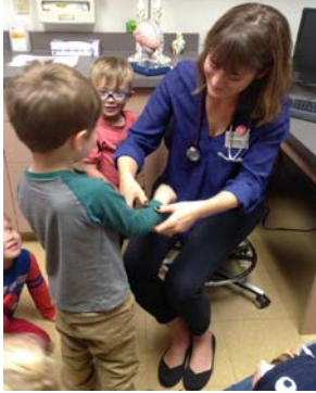
Children visit the Student Health Center.