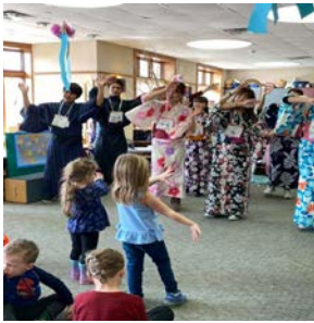
Students from Japan visit Campus Child Center.