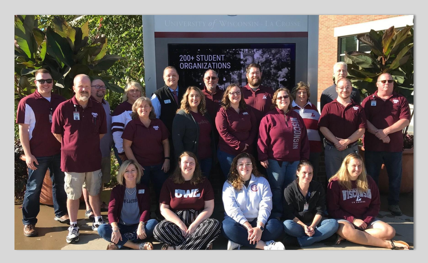
University Centers Staff ready for the fall semester - September 2021