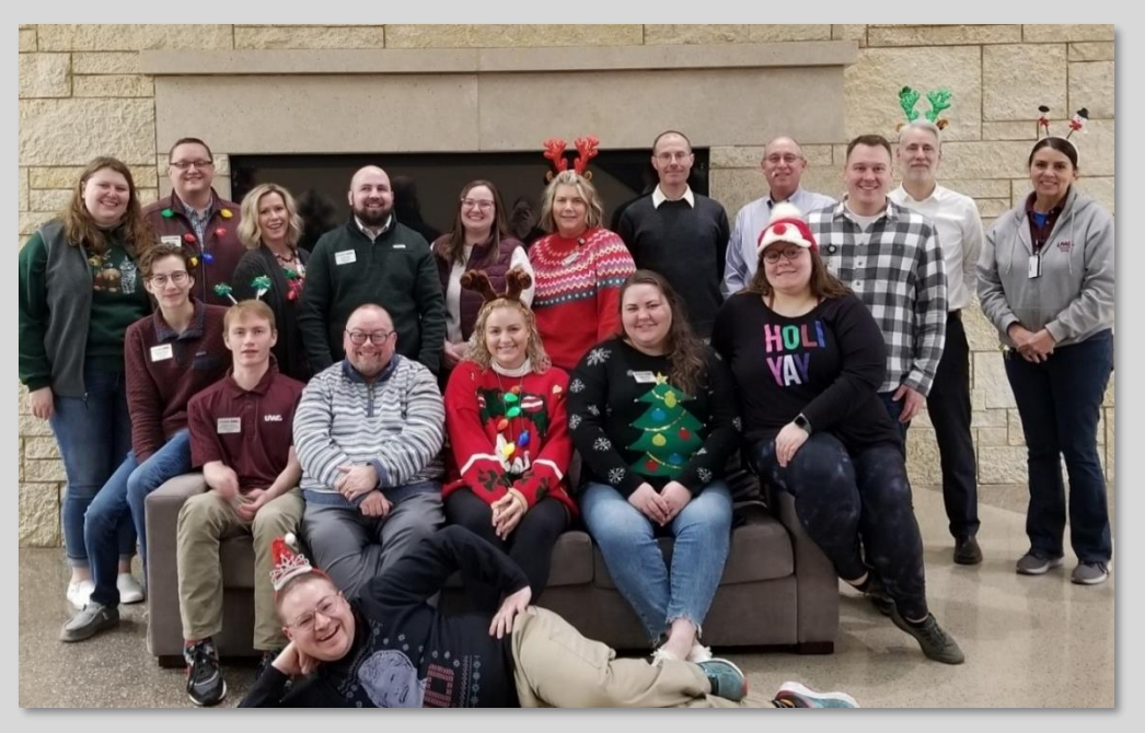
University Centers Staff – December 2022