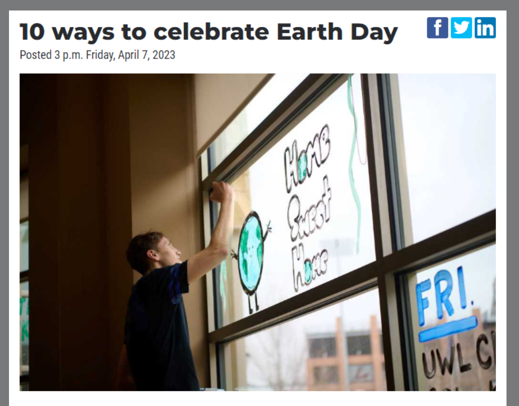
A student paints on a UWL Student Union window for Earth Day celebrations in 2022.

The above graph highlights the findings of the campus carbon footprint analysis. Notably, UWL has seen a reduction in carbon emissions from heating and electricity production sources by roughly 30% despite increasing building space by 40% since fiscal year 2005!