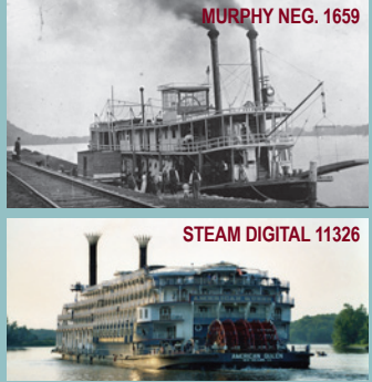
Each image has an identifier (i.e., MURPHY NEG. 13799). Use these indentifiers to easily find the images you're interested in.