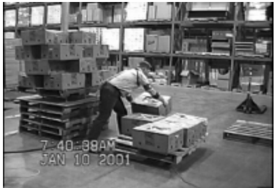
Figure 2. Subject being tested using the Motion Monitor Electromagnetic Tracking Device

Week one was devoted to evenly dividing experimental and control groups based on anthropometric data. Baseline testing was also performed during this time. On week two, the experimental group received technique coaching and auditory feedback through speakers based on the magnitude of the moments during lifting/lowering (Figure 2) (Lift Trainer Software, IST, Inc., Chicago, IL). On week four, the experimental group received the same coaching and auditory feedback. On week six, all participants were tested under the same conditions as during the baseline testing.