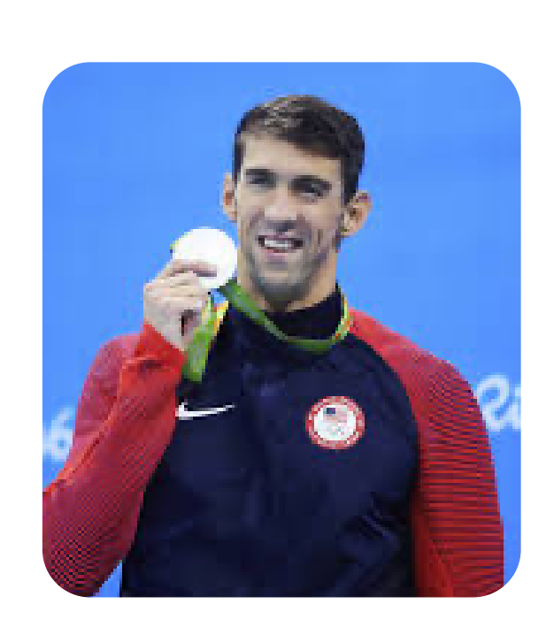
Michael Phelps Olympic Swimmer

"I remember sitting in my room for four or five days not wanting to be alive, not talking to anybody. That was a struggle for me. I reached that point where I finally realized I couldn't do it alone."